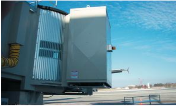
Figure 7. Baggage Elevator Mounted on Jet-bridge

The method for getting bags from the gate to the ramp area for loading onto the aircraft has both an economic and an operational component. The economic considerations will be covered in the next section, but regarding operations, two different methods are used in the pink-tag system's current application. First, some jet-bridges have baggage elevators installed on them as in Figure 7 below.