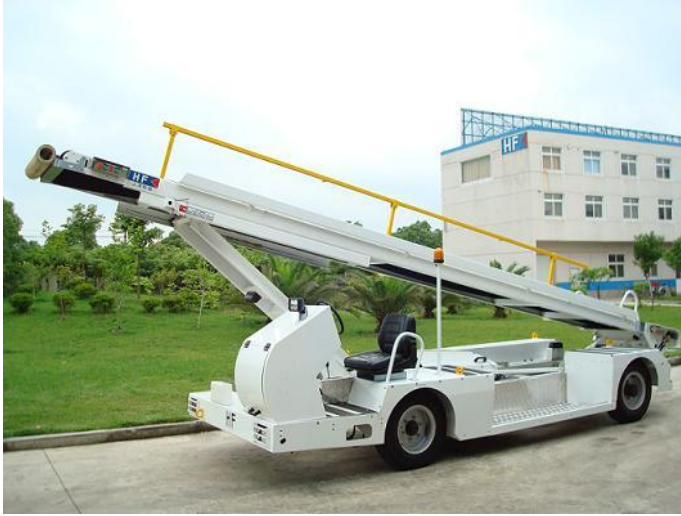
Figure 8. Baggage Belt Loader.

In this case, passengers leave their pink-tagged carryon luggage at the bottom of the jet-bridge just prior to entering the aircraft. The belt-loader is then used to move the bags over to another belt-loader that is positioned at the cargo bin. This method is equipment intensive and would also fail to accommodate the need for gate agents to be able to check bags in early, as the transfer point is only accessible to passengers after being cleared to board. (Aho, 2010)