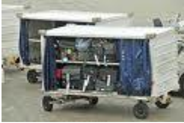
Figure 5. Airport Baggage Carts

often inoperative. Some bags do fall out. They are of course found, and hopefully before they are run over by another cart, but they will be delayed and potentially miss their flight.