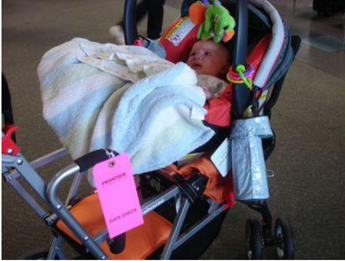
Figure 1. Baby Stroller with Pink-Tag applied

Once in the jet-bridge, the passenger tenders their pink-tagged bag to a ramp agent. The ramp agent collects all such bags and then stows them in the cargo hold of the aircraft. Upon arrival, the bag is returned to the customer right there on the jet-bridge. If the customer is making any connections, they simply tote the bag with them to their next departure gate, and if that plane is also a regional jet, the process is repeated. If this stop is their final destination and the pink-tagged bag is their only bag, then of course they proceed out of the airport with no need to stop at the baggage claim area.