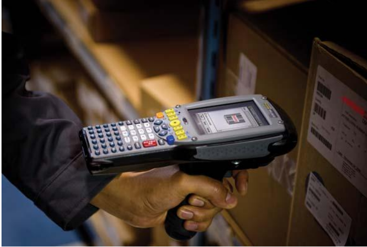
Figure 6. Airport baggage scanner

(Step 9) Bags unloaded from aircraft and sorted by agents into one of several carts