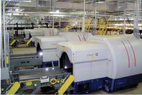
Figure 3. Airport Inline Screening System

are any concerns, the bag is redirected to a review bay for further screening. This typically only takes a couple of minutes, but at least two problems can occur.